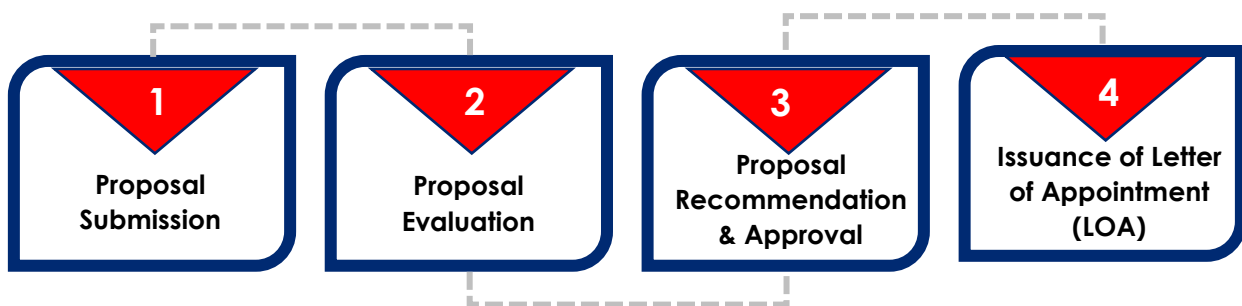
Pre-Implementation Process Flow