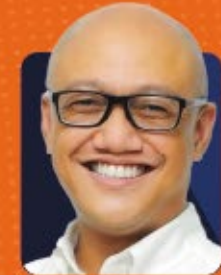
BEN UZAIR Media Personality & Entrepreneur