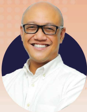
BEN UZAIR Media Personality & Entrepreneur